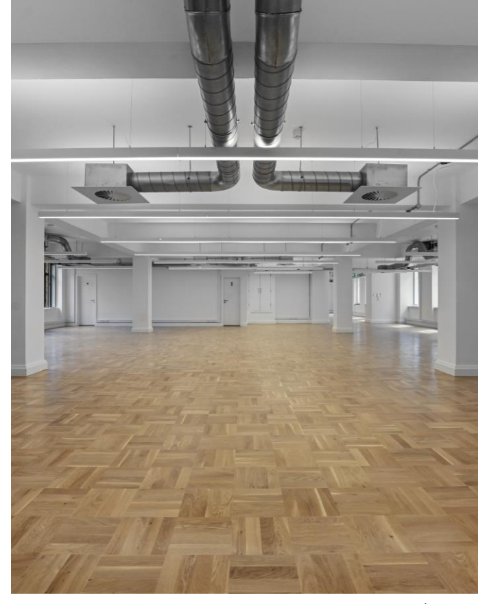
Refurbished 5th floor